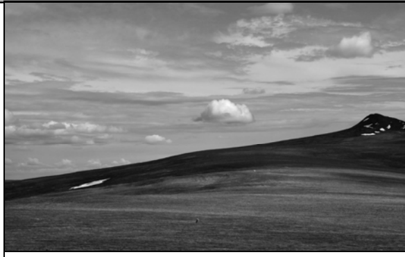
A campsite on a ridge above Illuguruk Creek, Utukok Uplands