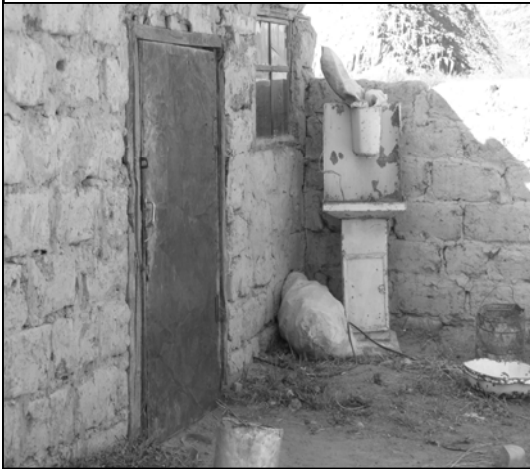
A wash basin outside a winter home.

Most people in the city of Bayan Olgii do not have running water but, instead, share wells and have pit latrines. There is a central bath house where families go two or three times a week for a hot shower. In the homes in the city there are sinks with one-gallon tanks above them for face washing each morning.