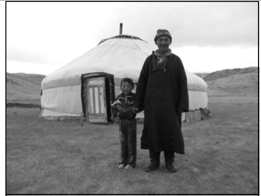
A herder and his son outside the family ger.

In one valley, I had the opportunity to stay with an elderly herder couple. The man was the Environmental Protection Minister for the entire valley and this required him to stay in the valley until the first snows arrived when no more people would be able to travel to the area. I shared GMCG's information with him and he explained his role in protecting the forests there