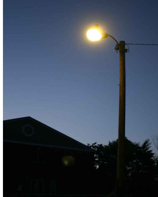
Powerful, unshielded flood light