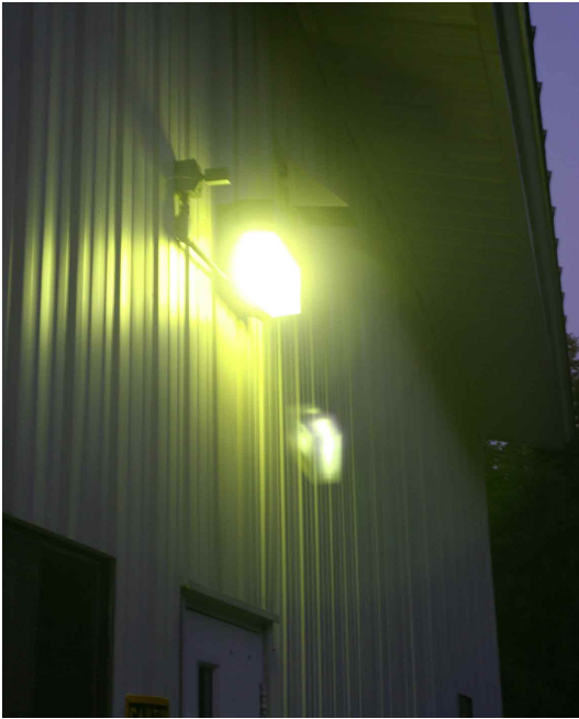
Poorly shielded “wall-pack” light causes dazzling glare at a local fire station