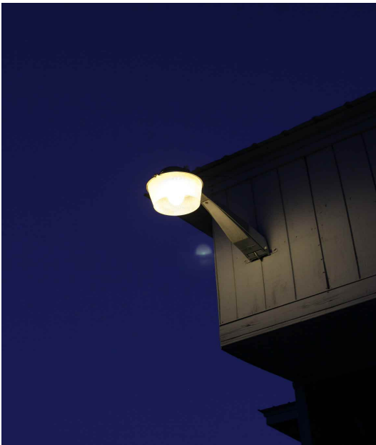
Popular mercury vapor/metal halide light fixture causes intense glare and sky pollution