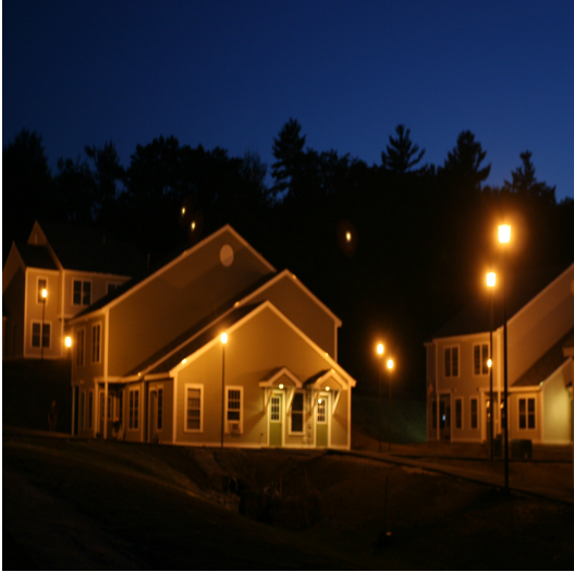
Intense, poorly shielded lighting illuminates rooftops, wasting energy and causing sky-glow