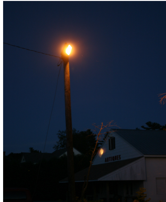
Angled, poorly shielded floodlight causes upward and down-street glare