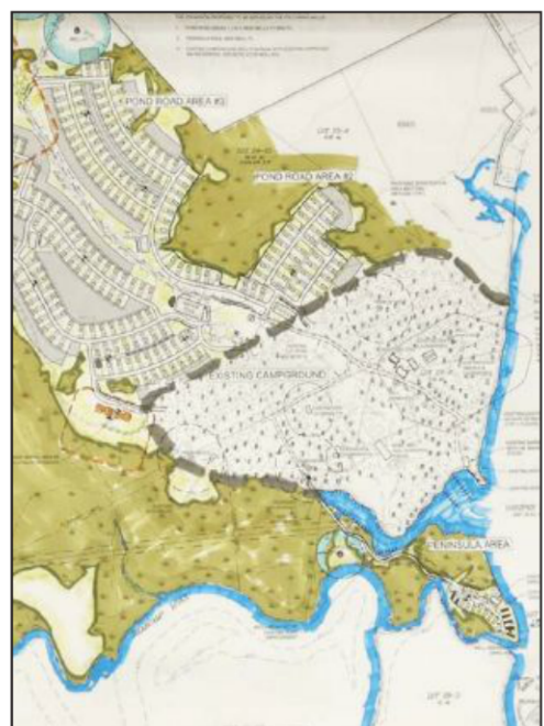
This map of the proposed Westward Shores campground project was discussed at the Ossipee Planning Board on Tuesday. At lower right is the peninsula in question.